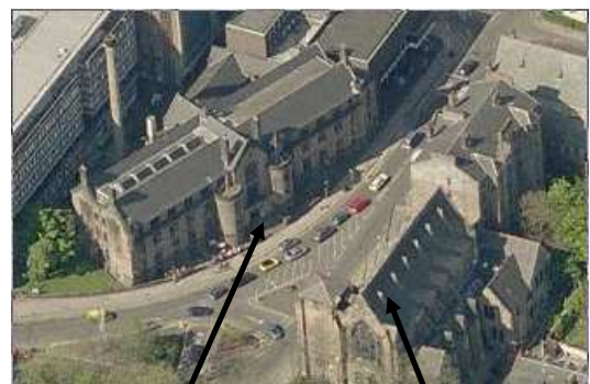
Glasgow University Union entrance.

The nearest underground station is Kelvinbridge , and the number 44 bus stops outside the Union.